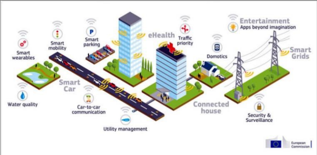
Figure 1. The framework for applying 5G technology to practice

In 2013, The European Commission launched the 5G Public Private Partnership (5G-PPP) in order to accelerate the 5G technology research development. The EU has also launched international co-operation with Brazil, China, Japan and South Korea. The strong commitment of the European Commission for 5G led to the adoption of a challenging target for deployment of 5G (and generally a very large capacity network); defining detailed measures for the implementation of goals; and a proposal of legislative measures aimed at facilitating 5G development. In September 2016, the EC adopted a series of initiatives and legislative proposals for the telecommunications regulatory framework reform, including: